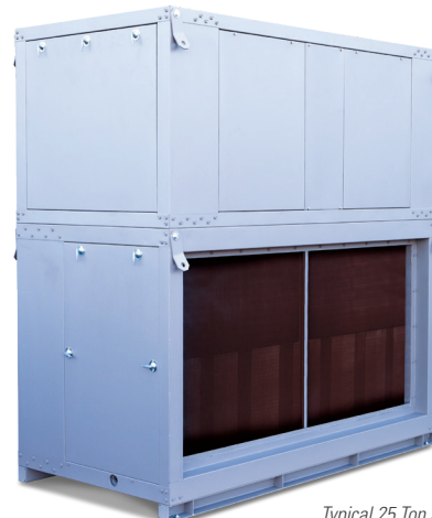
Typical 25 Ton Severe Duty Vertical Air Handler