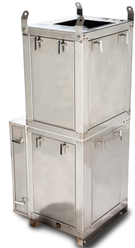
Typical 5 Ton Severe Duty Air Handler shown in stainless steel construction