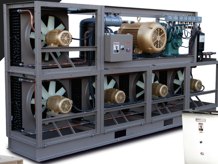
Typical 25 Ton Severe Duty Air Cooled Condenser