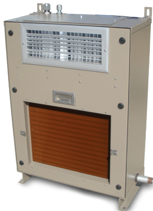
EP-FW Floor Wall Mount Evaporator show in front supply air discharge