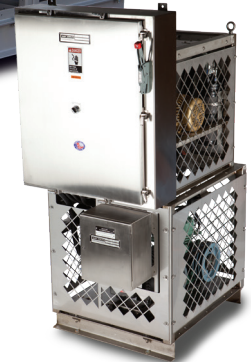
Typical 2 - 5 Ton Severe Duty Air Cooled Condenser

The HDT Nordic Severe Duty (SD) Series of air conditioners easily handle the most abusive environments for air conditioning, filtering, heating and ventilation under severe temperatures, extreme dirt, and corrosive conditions.