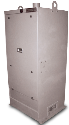
F-Series Filter/Pressurization Unit