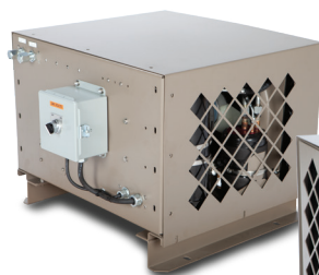
Typical 1 Ton Severe Duty Condenser