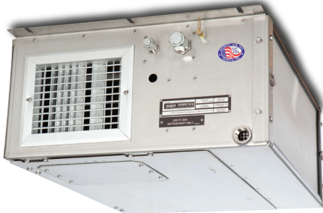
EZ-CL Ceiling Mount Evaporator shown in stainless steel and powder coated construction

Custom designs are available for all condensers, air handlers, and evaporators. Please consult factory for details.