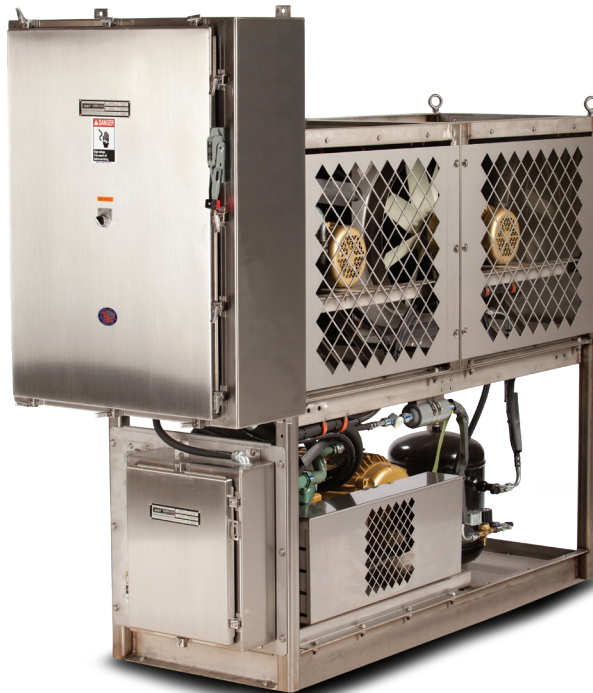
CA-L3 Condenser shown in stainless steel construction